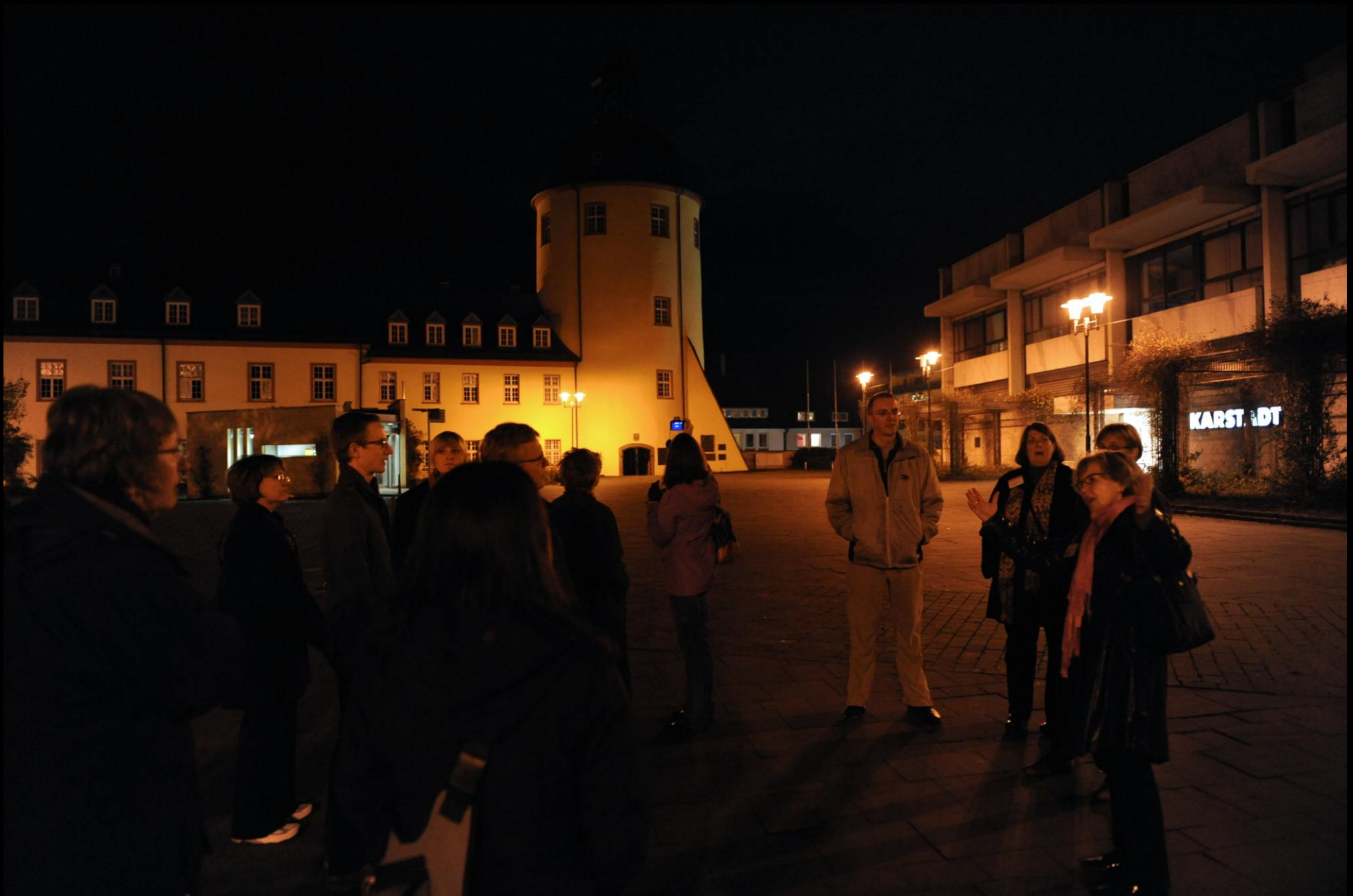
The former heart of the city: surrounded by the mausoleum the museum of contemporary art and a small shopping mall