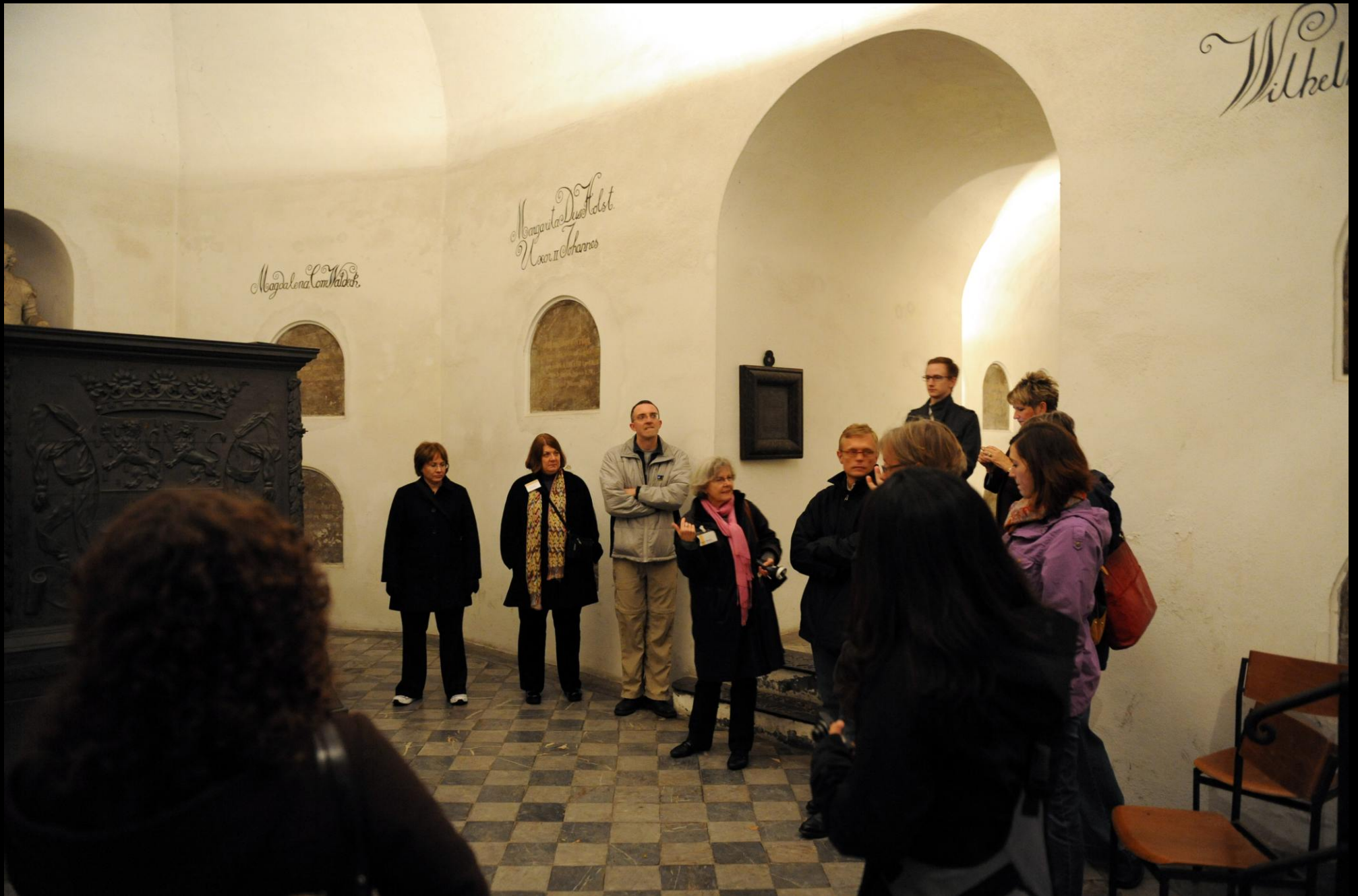
Inside the mausoleum