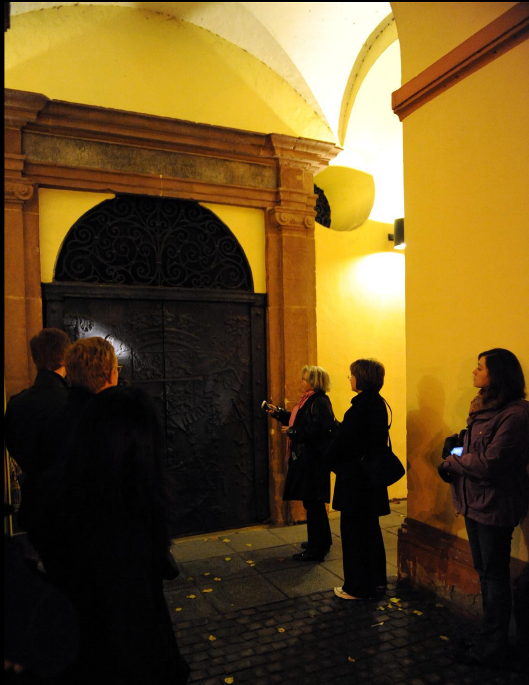
The entrance to the mausoleum