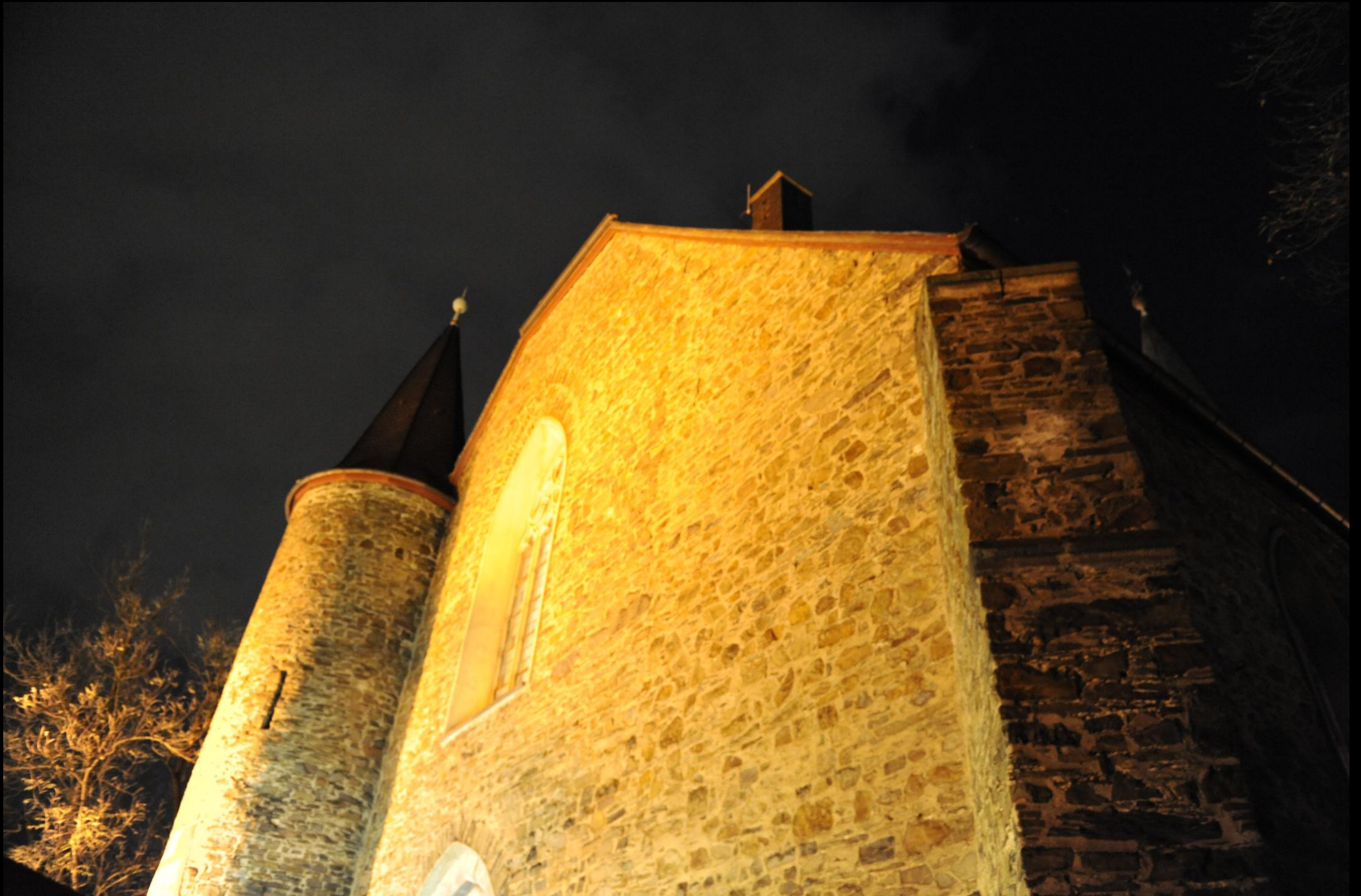
„Martinikirche“ at night