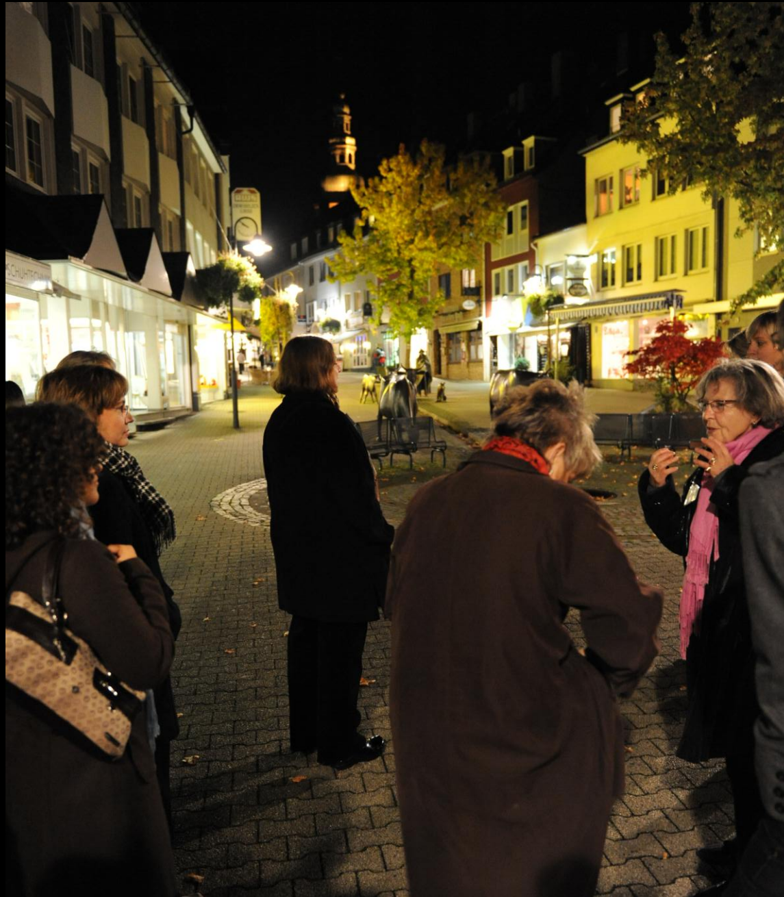
The old „Poststraße“ and the iron cows