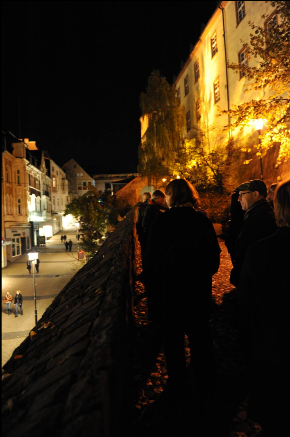
Guinness Book of Records: The most precipitous shopping street