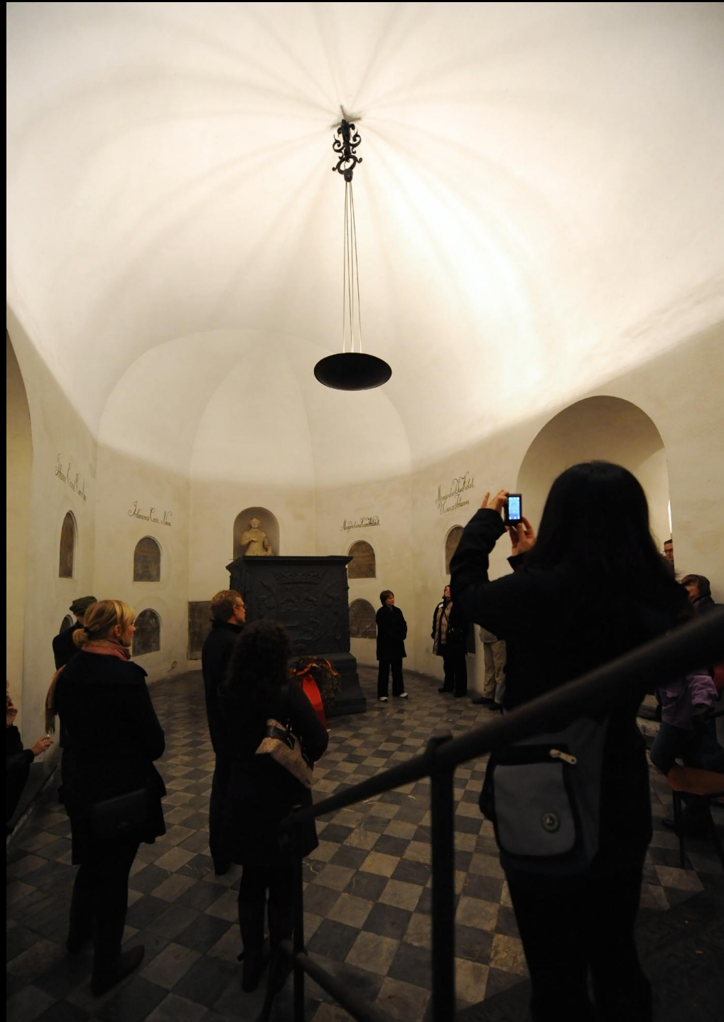
View from the stairs