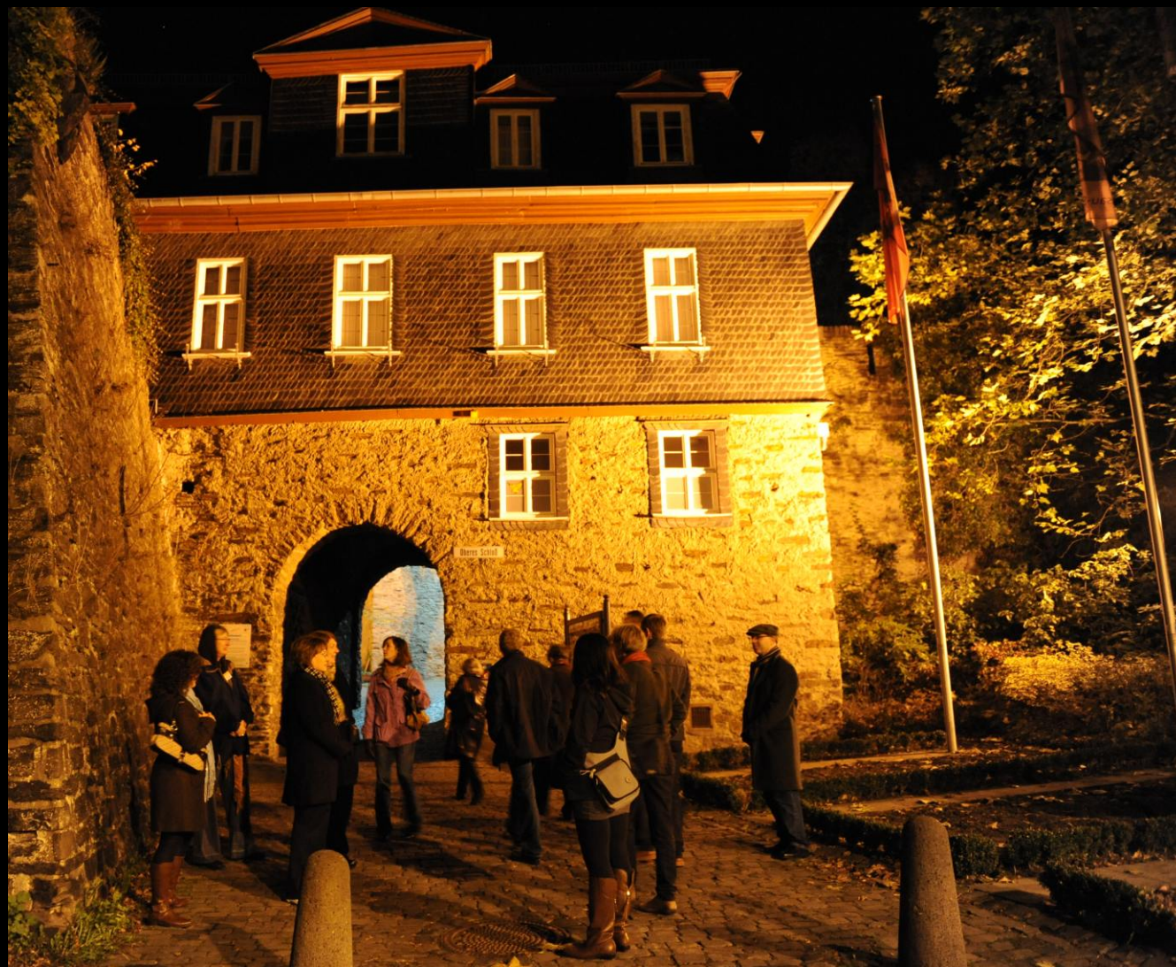
In front of the upper castle