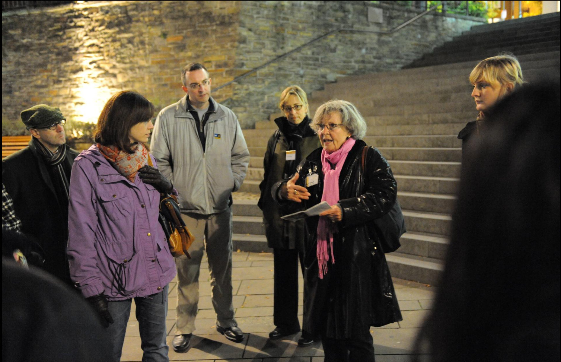
Siegen's Market Square in front of the „Nikolaikirche“