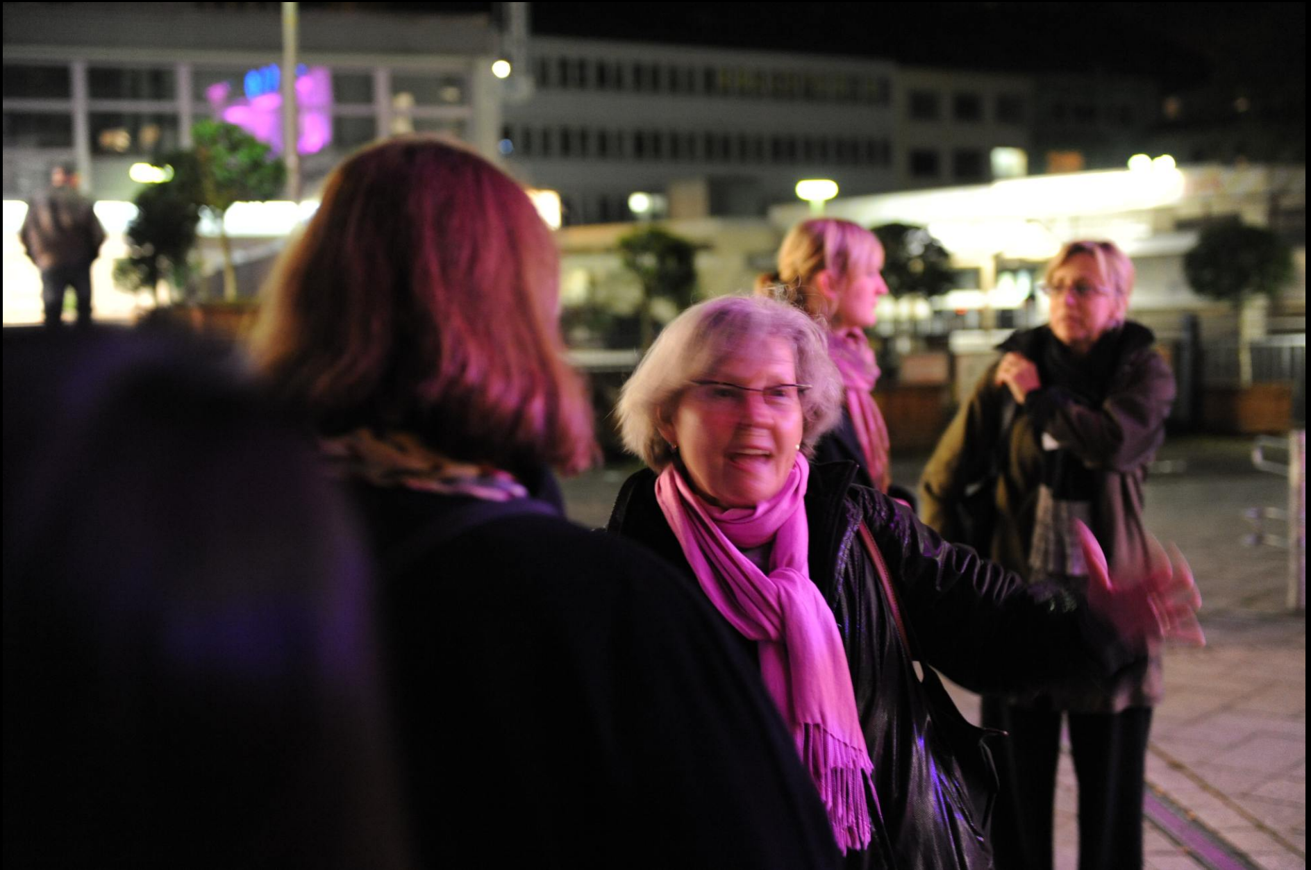
Excited about Siegen: The guide