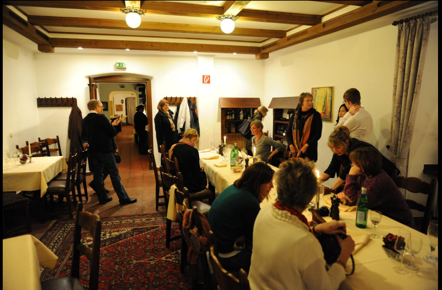
Dinner in the „Schloss-Stuben“