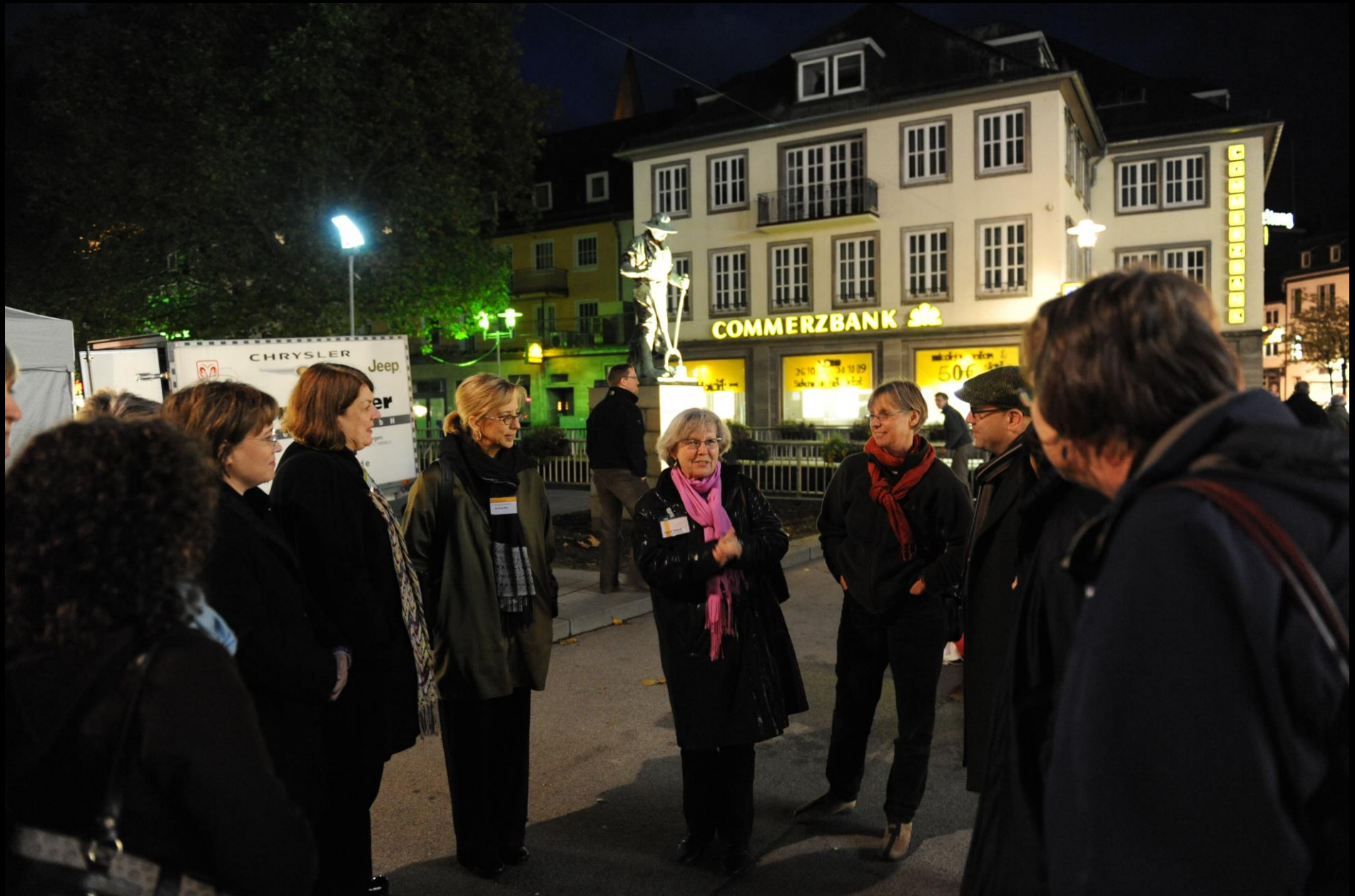
"Siegplatte", bronze statues "Henner & Frieder"