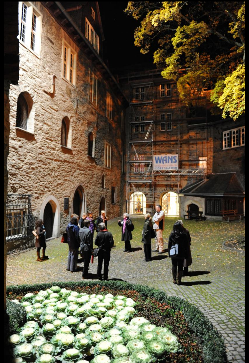
Inside the upper castle: the „Siegerlandmuseum“