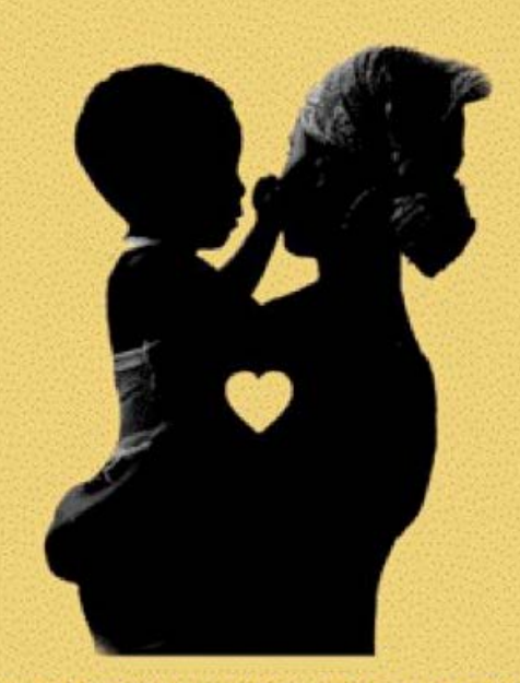
PART 1 - RESIDENTIAL CARE AS A LAST RESORT

DEPARTMENT OF SOCIAL WELFARE (DSW) MINISTRY OF MANPOWER, YOUTH AND EMPLOYMENT (MMYE) GOVERNMENT OF GHANA