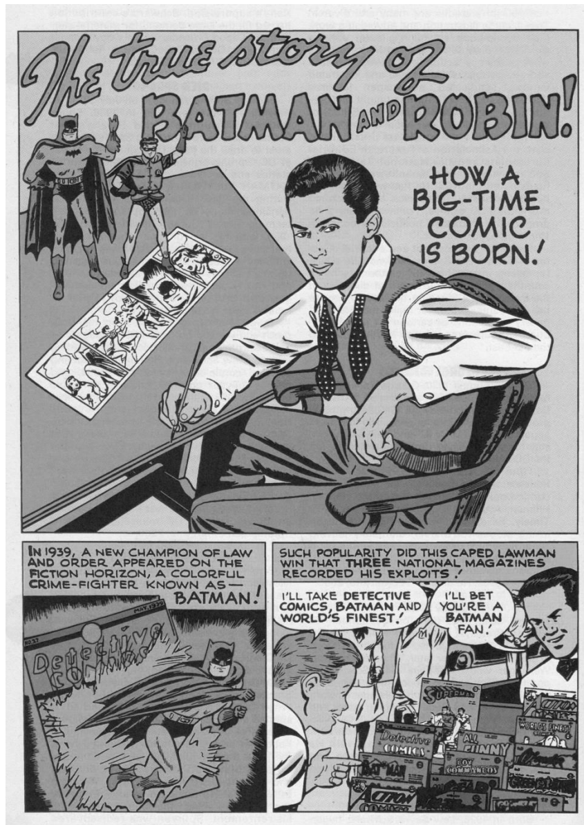
Figure 2: “The True Story of Batman and Robin: How a Big-Time Comic Is Born!” Real Fact Comics #5 (Nov.–Dec. 1946). © DC Comics. All rights reserved.