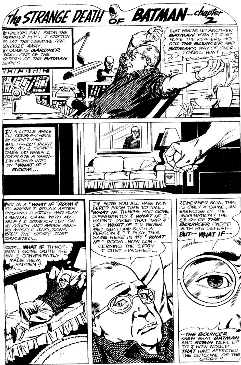
Figure 4: Gardner Fox and Carmine Infantino, "The Strange Death of Batman," Detective Comics #347 (Jan. 1966).