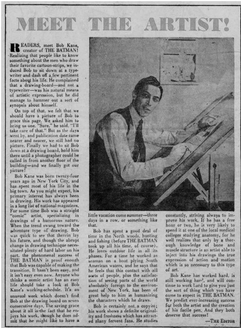
Figure 1: Batman #1 (spring 1940).