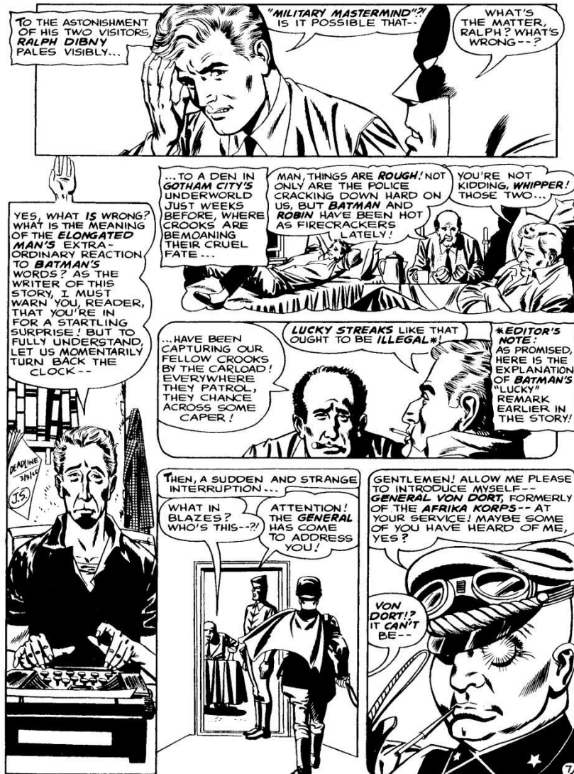
Figure 3: John Broome and Carmine Infantino, "The Secret War of the Phantom General," Detective Comics #343 (Sept. 1965). © DC Comics. All rights reserved.