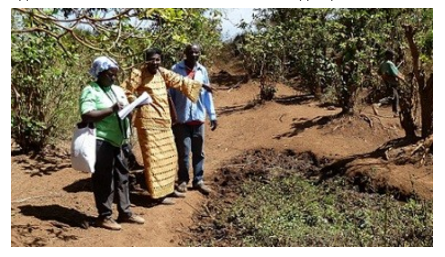
Surveying the Tsavo River Catchment: Its functioning is highly compromised.

The main objective was to understand challenges and opportunities for restoration of the degraded catchment and to come up with practical approaches. The team met in Loitokitok in the upper part of the catch-