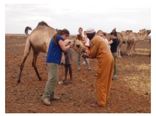
This camel proves to be more stubborn than expected.

To expand our knowledge of livestock production we were invited to the Ol Maisor Ranch where we experienced and assisted in veterinary services at the farm. The second half of our trip included the observation of veterinary and developmental research projects of VSF-Germany in North Horr.