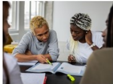
German Language Courses