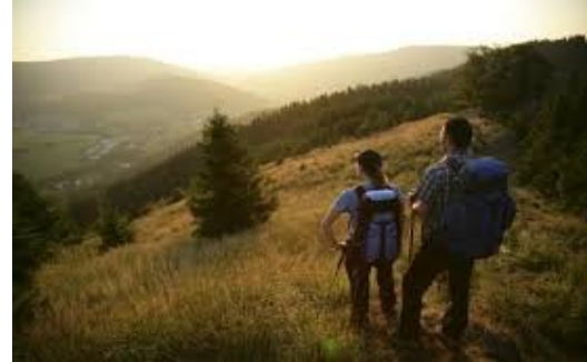
Rothaarsteig (hiking area)