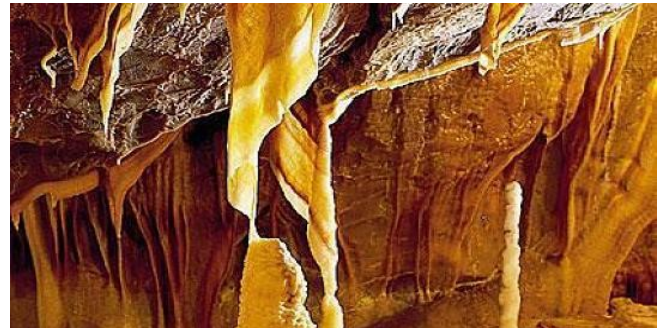
Atta-Höhle (flowstone cave)