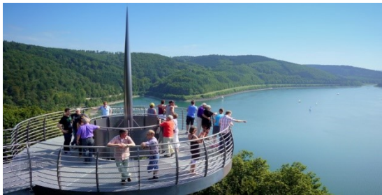
Biggensee (lake close to Olpe)