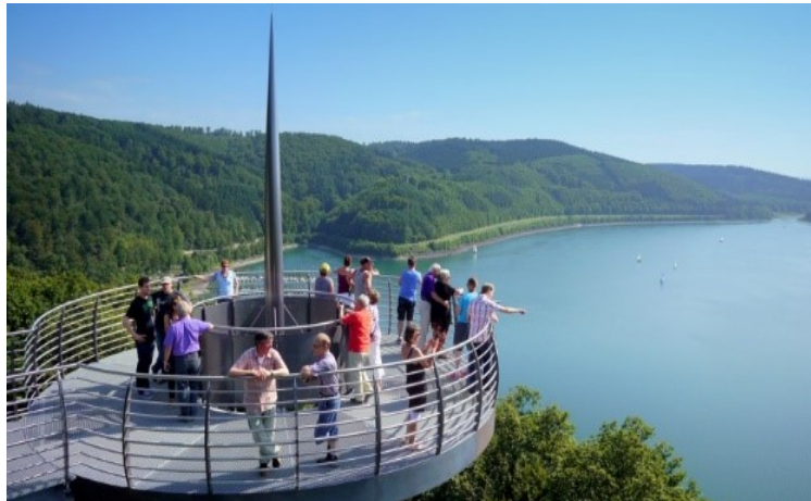
Biggensee (lake close to Olpe)