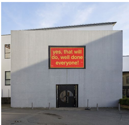
© Nora Turato (LED Screen)

The reception and award ceremony as well as the reading with Lucy Caldwell will take place at the gallery of contemporary art ("Museum für Gegenwartskunst Siegen"), which is located next to the "Hörsaalzentrum".