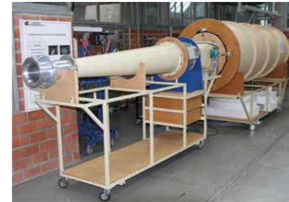
Fig. 1: Test bench for the validation of the computational fluid dynamics (CFD) simulations.

Figure 3 shows the extension of achievable regions in the Cordier diagram through the active learning strategy. For almost each viable specific fan speed \sigma , higher specific fan diameters \delta are possible. Additionally, lower and higher specific fan speeds could be achieved. The absolute efficiency was improved by up to \Delta\eta_{ts} = 0.3 ( \approx 100\% ) through the active learning strategy, see Fig. 4. The improvements are mostly achieved above the Cordier curve where the specific fan diameter is relatively high.