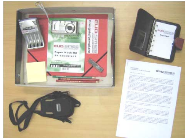
Figure 1: Infrastructure Probes Package

between two applications is done by paper documents). The Post-it's are intended to be used for taking down short notes. Their small size makes it possible to put them on the desk, without hindering the normal work. Besides, they can be used to mark important areas in paper documents or on the desk, before pictures are being taken.