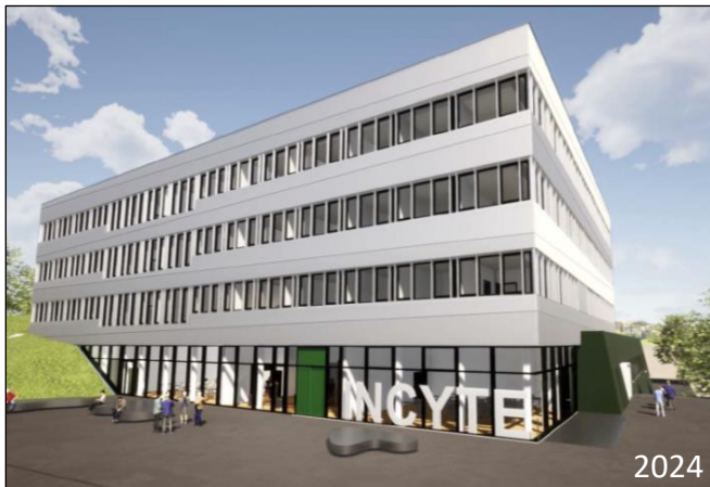
New INCYTE research building – the prospective home to the MNaF

MNaF facilitates both, fundamental materials research as well as the application-driven development of novel materials and devices.